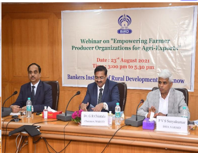
DMD NABARD moderating the panel discussion