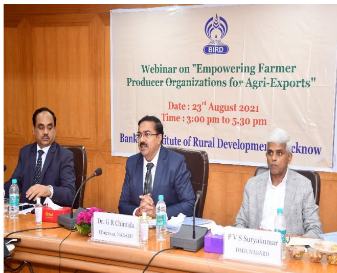
Chairman NABARD delivering the keynote address