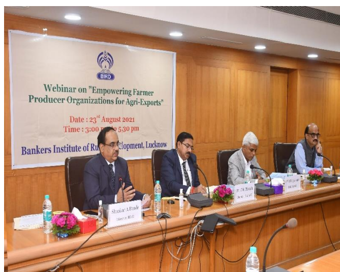
Director, BIRD welcoming the dignitaries and the panellists